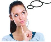
Thinking About Taking on a Home Improvement Project Yourself?