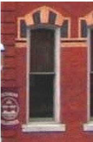
Such as the window and brick detail shown

This brochure is to help you understand the process of maintaining the historic value,