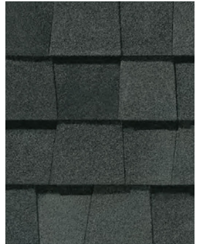
Max Def Moire Black