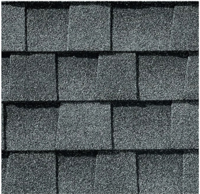
Sample picture of a Sears Alhambra with a similar roof