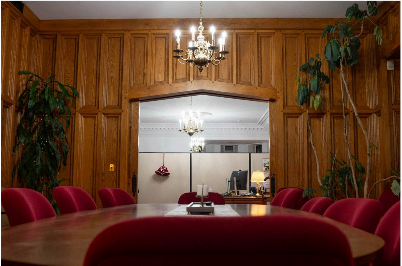
A conference room in the new Bellefonte Borough office on Thursday, Dec. 5, 2024.